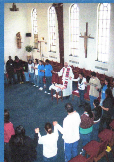
Youth celebrate Mass at Cabrini Retreat Center.